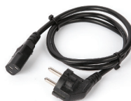
AC Power Cable