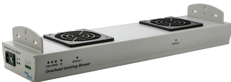
Model 3820E/EL overhead Ionizing Blower